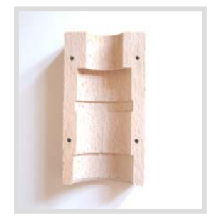
Make sure the drilling is correctly centered and with sharp edges (without burrs/frays)