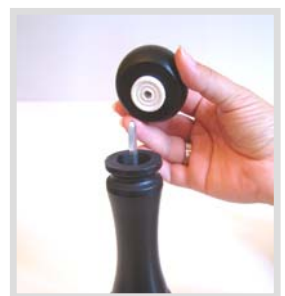
Press stopper onto the grinder