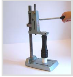
Press down until you feel a click