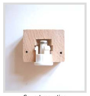
Correct mounting - catchers have rebound into the groove