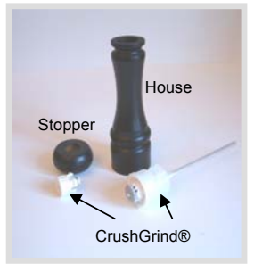
Wooden parts and CrushGrind® SHAFT