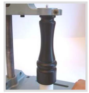
Make sure the catchers on CrushGrind® are fully rebound