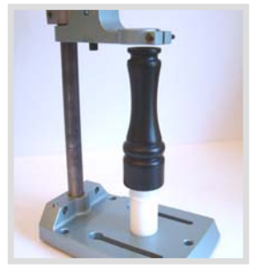
Make sure the grinder stands straight