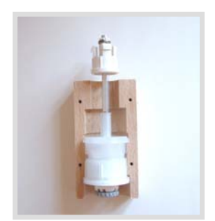
Correct mounting seen through the grinder