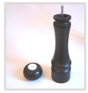
Mounted stopper and grinder