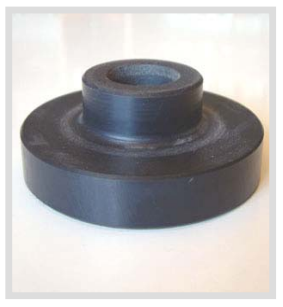
Use a gauge to check if CrushGrind® has been mounted correctly