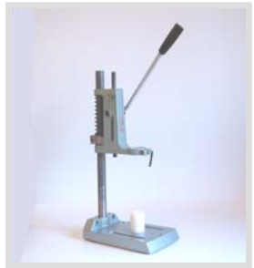
Manual mounting machine