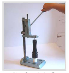
Press down the handle