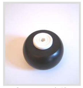
Stopper mounted with top fix