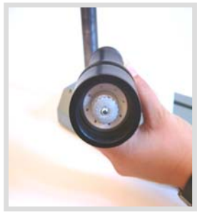
Check that CrushGrind® is sitting correctly at the bottom