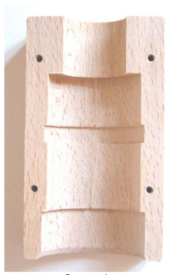
Correct! Sharp edges (no frays) Drilling correctly centered